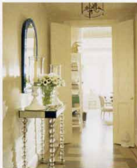
On the Cover A 1940s crystal-and-mirror console sparkles in the entrance hall of Timothy Whealon's Fifth Avenue apartment. "Eye of the Storm," page 156. Photography by Pieter Estersohn; produced by Dara Caponigro.