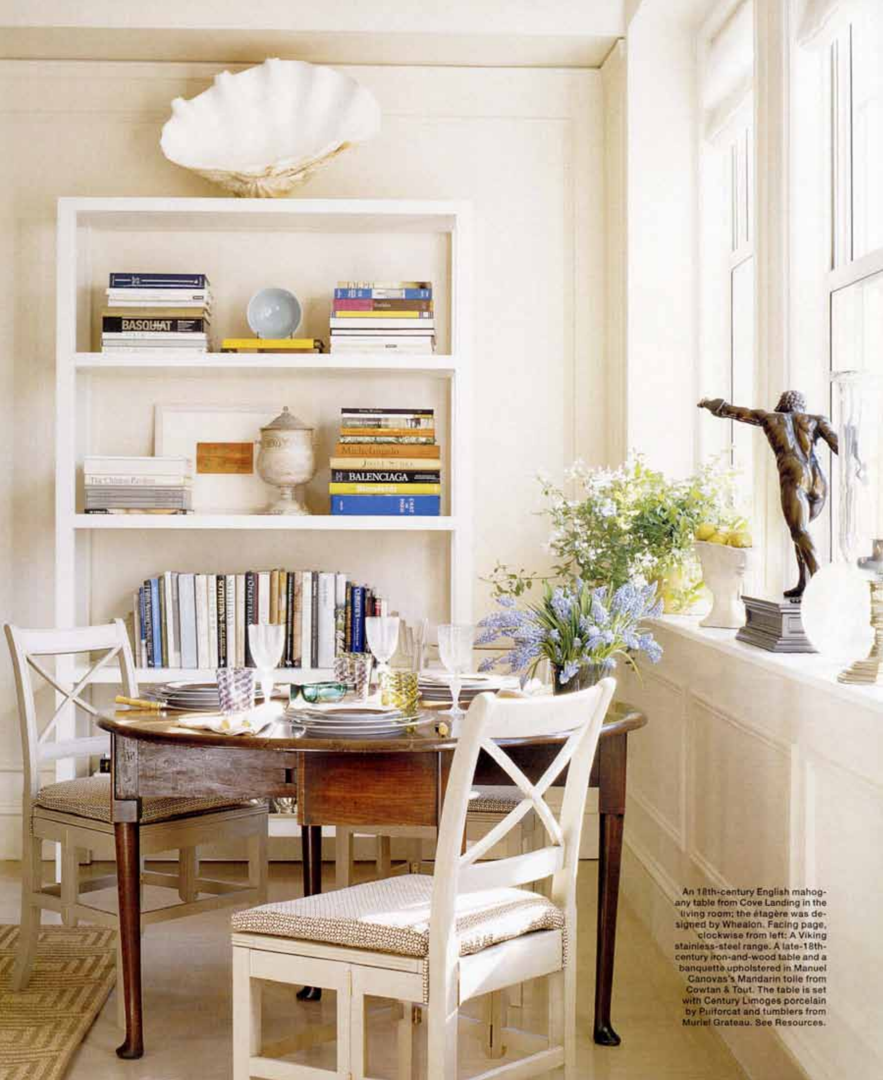
An 18th-century English mahogany table from Cove Landing in the living room; the étagère was designed by Whealon. Facing page, clockwise from left: A Viking stainless-steel range. A late-18th-century iron-and-wood table and a banquette upholstered in Manuel Canovas's Mandarin toile from Cowtan & Tout. The table is set with Century Limoges porcelain by Puiforcat and tumblers from Muriel Gateau. See Resources.