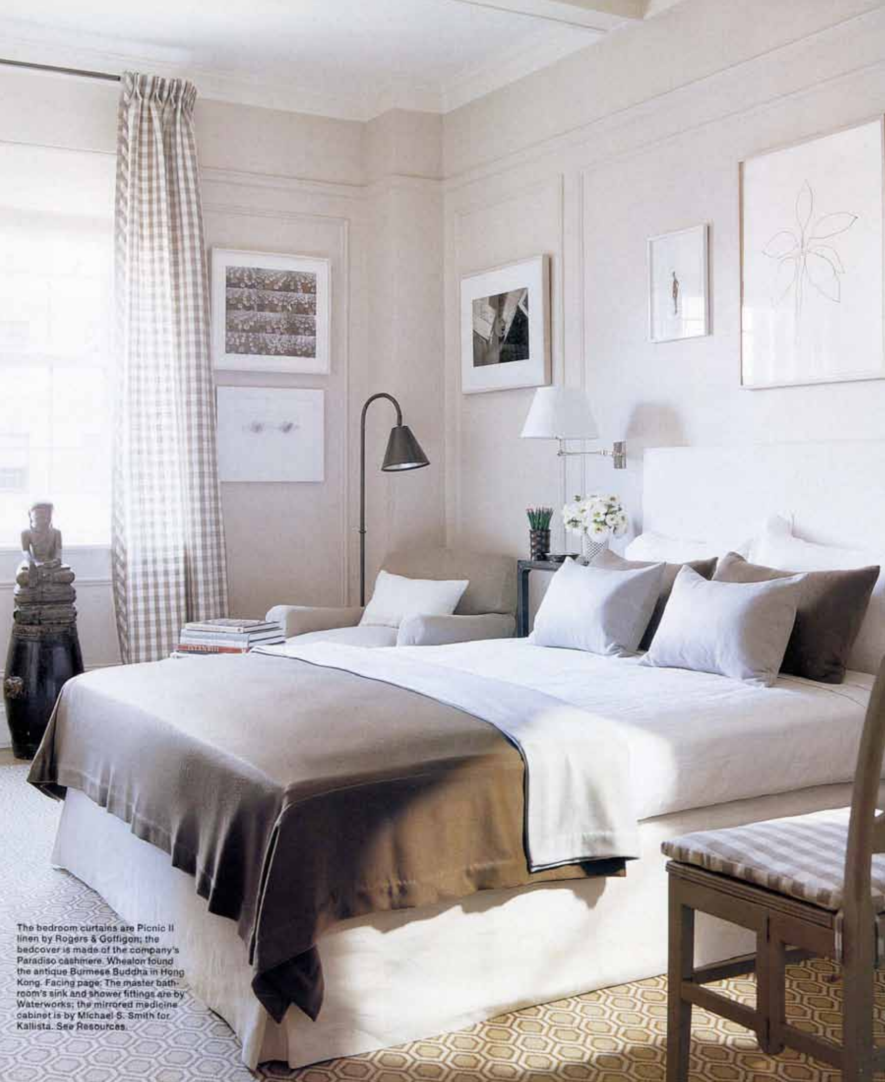
The bedroom: curtains are Picnic II linen by Rogers & Goffigon; the bedcover is made of the company's Paradiso cashmere. Whealon found the antique Burmese Buddha in Hong Kong. Facing page: The master bathroom's sink and shower fittings are by Waterworks; the mirrored medicine cabinet is by Michael S. Smith for Kallista. See Resources.