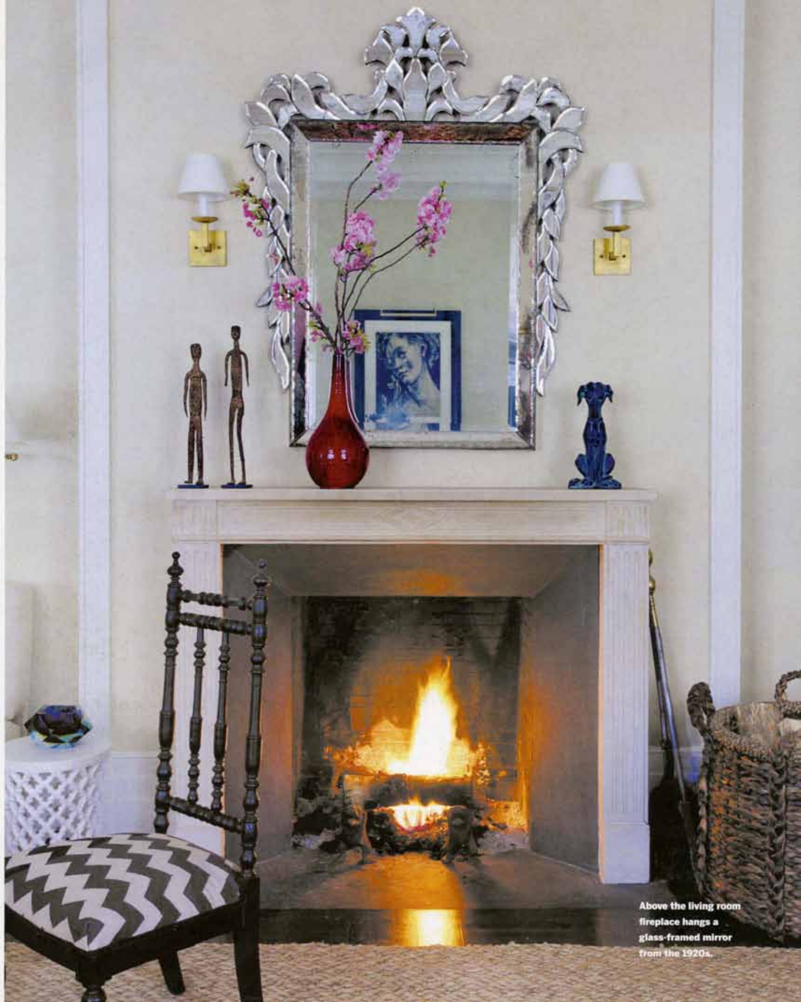
Above the living room fireplace hangs a glass-framed mirror from the 1920s.