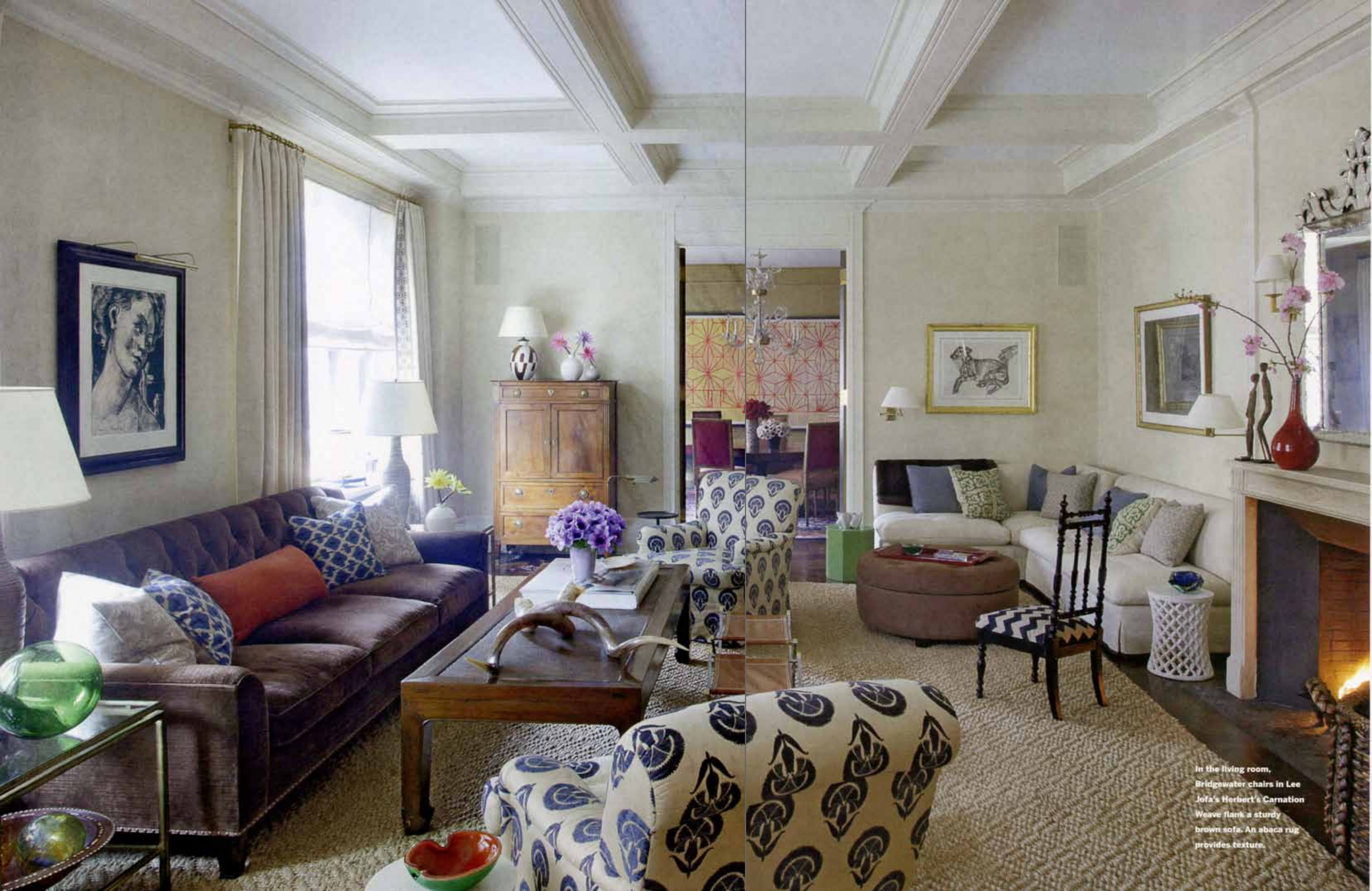
In the living room, Bridgewater chairs in Lee Jofa's Herbert's Carnation Weave flank a sturdy brown sofa. An abaca rug provides texture.