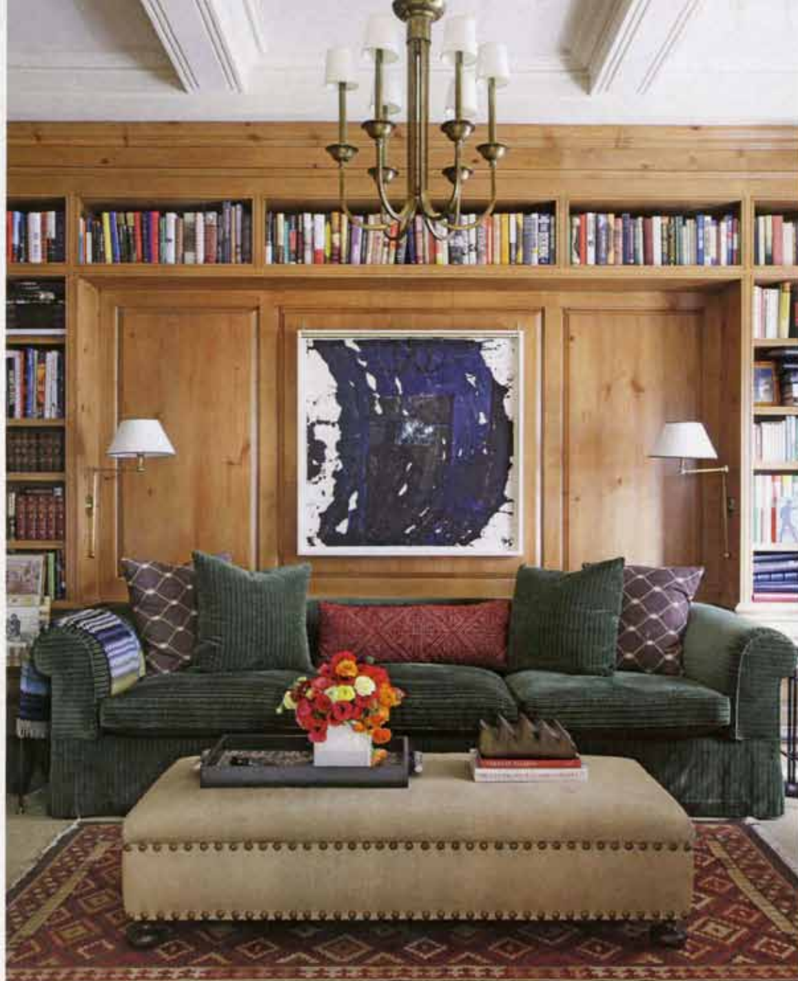
The library, paneled in reclaimed pine wood, has a view through to the dining room at the other end of the apartment. The sofa is covered in Velvet Mogador in Foret from Old World Weavers, and the ottoman is covered in a pale cowhide.

been hand-stenciled in a dramatic tree pattern, based on 18th-century wallpaper in Sweden's Drottningholm Palace, the current home of the Swedish Royal Family. The main dining and living rooms lead off to the right, where Whealon has given the couple a fresh contemporary style of decorating that suits their new uptown lives. Especially as they have now had two children in quick succession. "Their mother kept the original guest bedrooms as they were, she just gave them children's beds and added her own personal touches," adds Whealon.